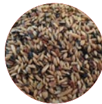
Canary No Rapeseed